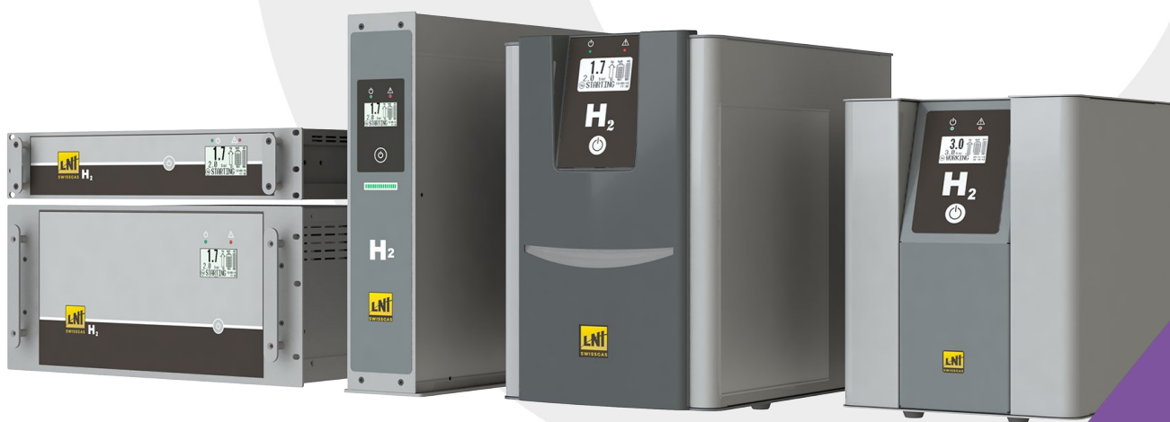
LNI Swissgas range of Hydrogen generator, from rack 19" to the smallest HG ST range.

To switch from Helium to Hydrogen, do not hesitate to contact us!